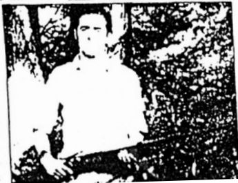
• DeANDRADE: 'Something evil'

compan- ies exist in a part of New England known as the Bridge- water Triangle. The Bridge- water Triangle, which includes parts of Bridge- water, Rayn- ham and Taun- tona, is an