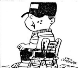
"Who do you guys holler at when I'm in school?"

"These questions as well as others are why I will lead my team into the Bridgewater Triangle to investigate these mys- teries."